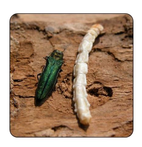
Emerald Ash Borer