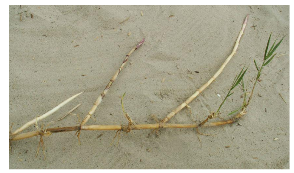
Root system of established stand. Wisconsin Wetlands Association