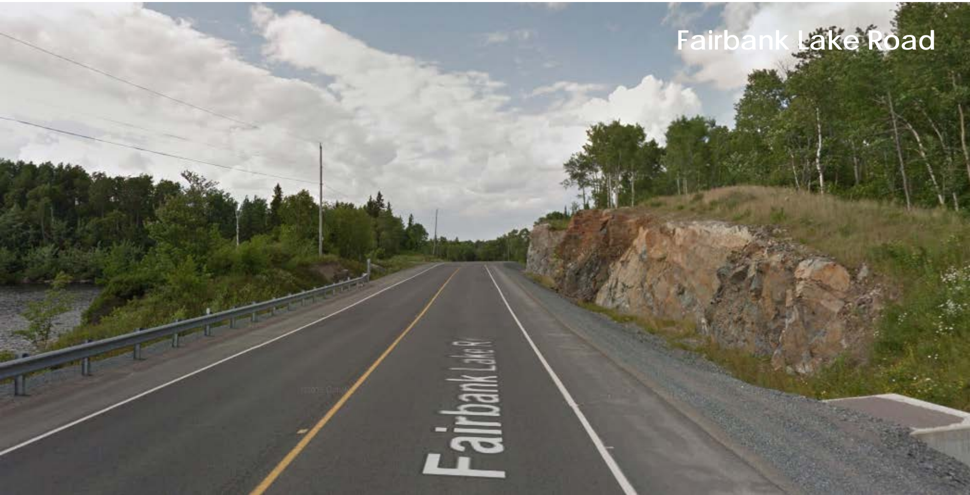
Fairbank Lake Road