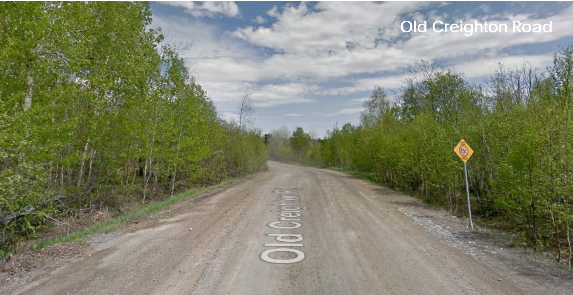
Old Creighton Road