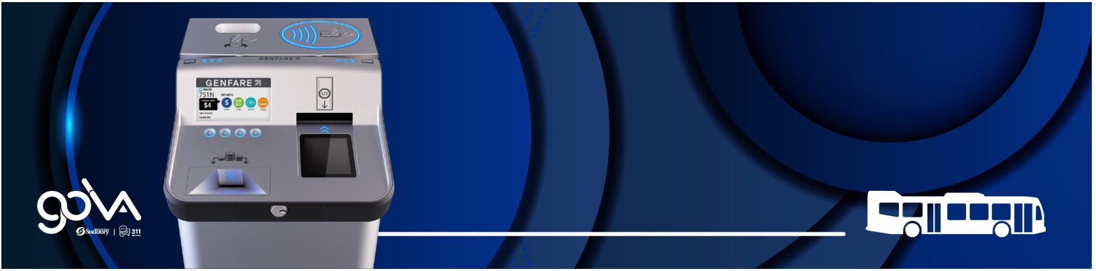
New Farebox – Swipe for ride cards located horizontally at front of farebox