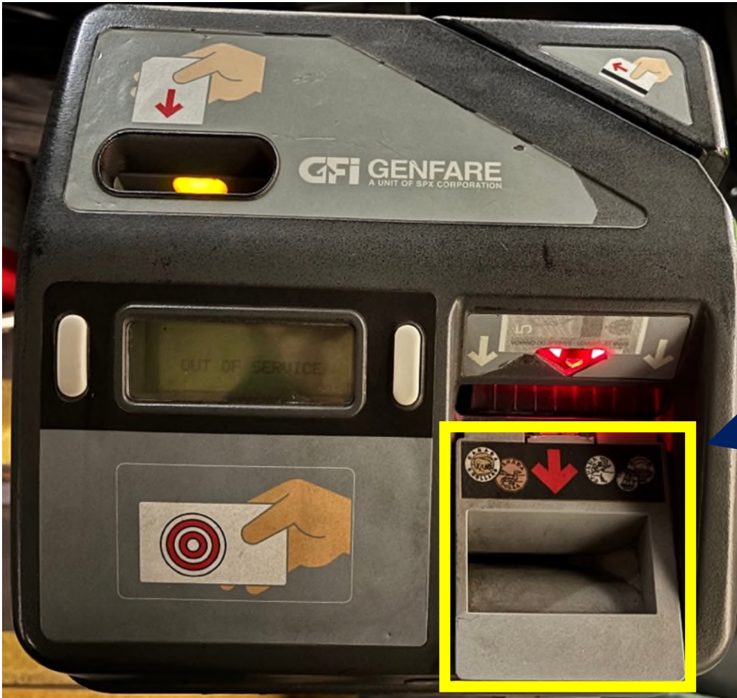
A photo of the old farebox showing, yellow box around the area where riders would deposit coins for cash fare payments.