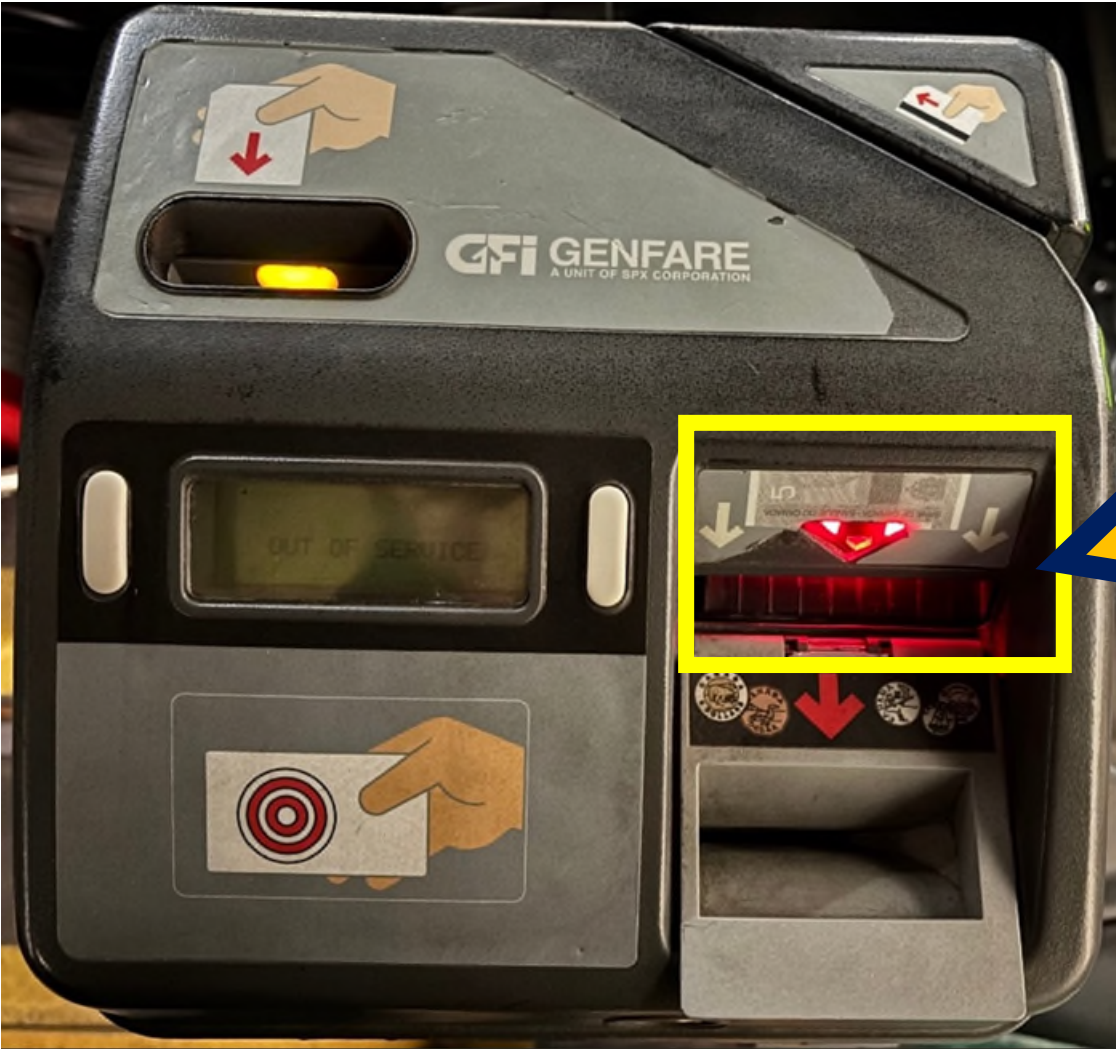
A photo of the old farebox showing, yellow box around the area where riders would deposit paper money for cash fare payments.

Old Farebox – Paper money deposited on right-hand side of farebox, above the coin deposit