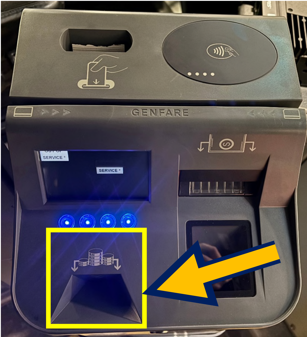
Photo of new farebox with yellow box around the area where coin cash fare is deposited.