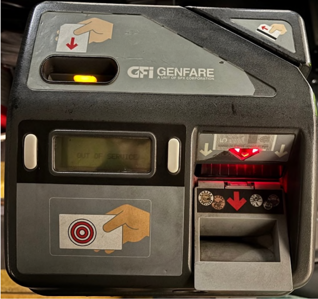
A photo of the old farebox showing, the swipe located at the back of the unit on an angle, paper money deposited to the right, coins deposited to the right underneath paper money.