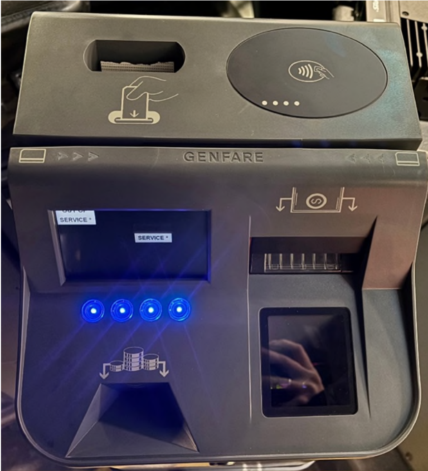
A photo of the new farebox demonstrating swipe area horizontally at the front of the unit, area for paper money to be deposited to the right, coins to be deposited to the left.