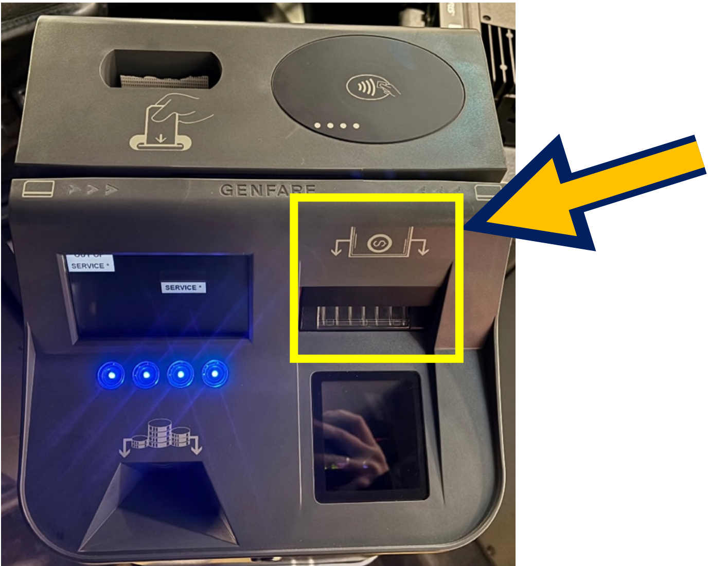
Photo of new farebox with yellow box around the area where paper money cash fare is deposited.

New Farebox – Paper money deposited on right-hand side of farebox