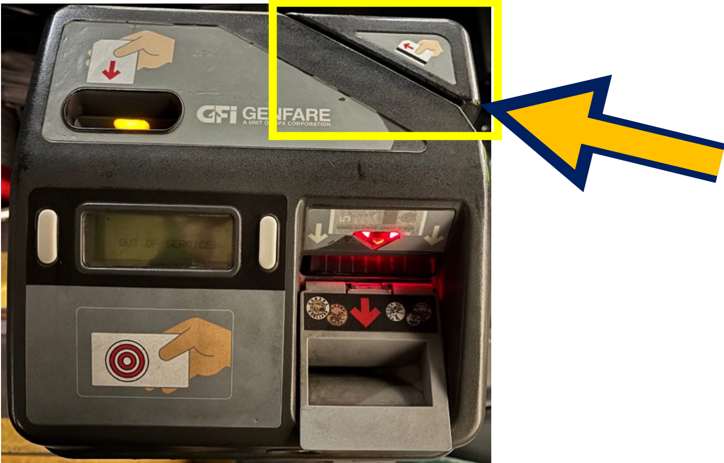
A photo of the old farebox showing, yellow box around where riders used to swipe their ride cards.

Old Farebox – Swipe for ride cards located at back of farebox on an angle