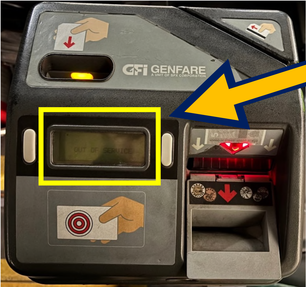
A photo of the old farebox showing a yellow box around the display screen.

Old Farebox – Smaller, narrower, lower contrast display screen