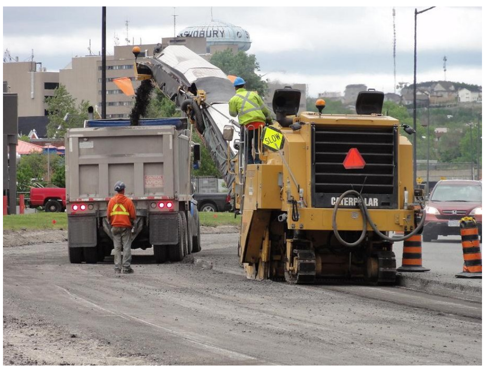
Exhibit 7 – Grinding Brady Street

Of the five contracts we reviewed in this audit, the MR80 Frost to Glenn contract did not specify who owned the grindings, and although this material would be owned by the City under the General Conditions of the contract, the contractor took ownership of them.