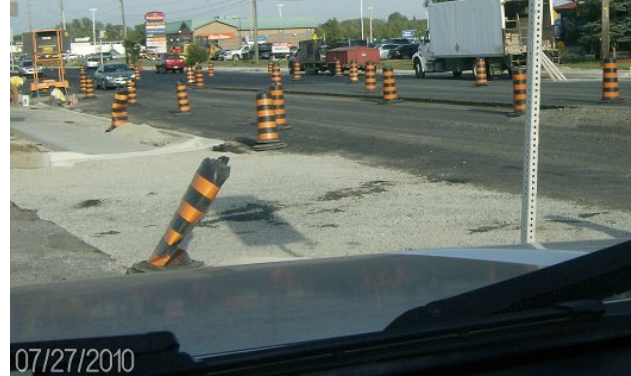
Exhibit 1 – Inferior Asphalt Supplied