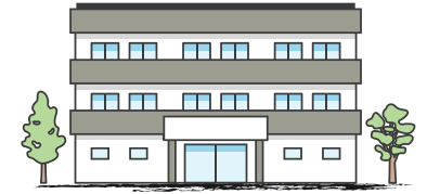
A small building with four homes

Four-unit housing can take many different forms, but it keeps the same scale to fit within existing neighbourhoods.