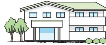
A house converted into multiple apartments