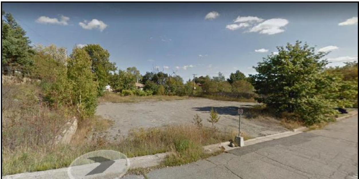
View of parking lot from Franklin Street facing east