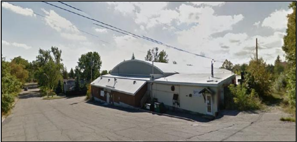
View of arena and curling rink from Franklin Street facing south-west