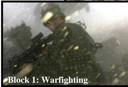
Block 1: Warfighting