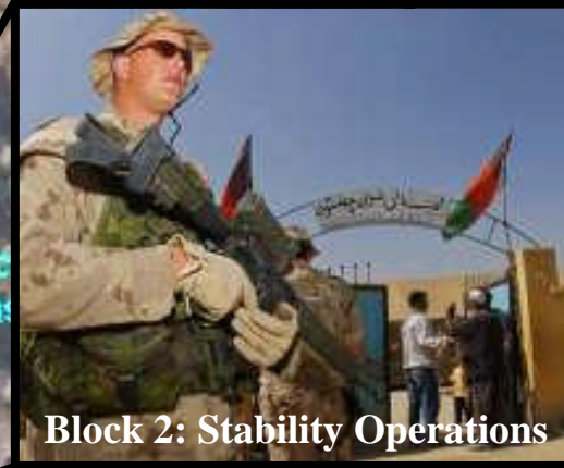
Block 2: Stability Operations