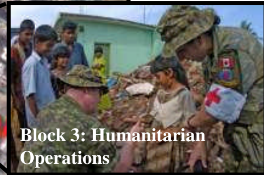
Block 3: Humanitarian Operations