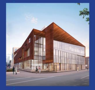
Place des Arts