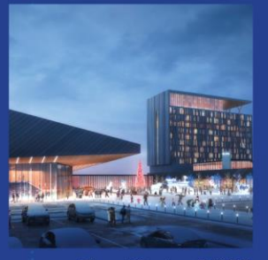
Event Centre @ KED