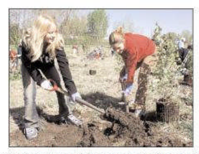
Junction Creek Stewardship Committee