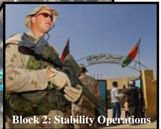
Block 2: Stability Operations