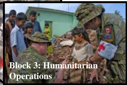
Block 3: Humanitarian Operations