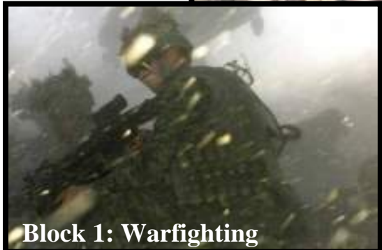
Block 1: Warfighting